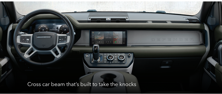
Cross car beam that's built to take the knocks

The Defender 90 is the most capable Land Rover yet, reimagined with visually compelling looks, a go-anywhere-do-anything attitude and toughness at its very core.