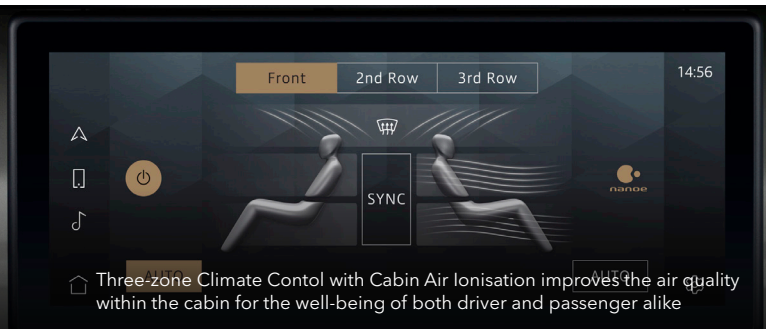
Three-zone Climate Control with Cabin Air Ionisation improves the air quality within the cabin for the well-being of both driver and passenger alike