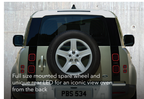
Full size mounted spare wheel and unique rear LED for an iconic view even from the back