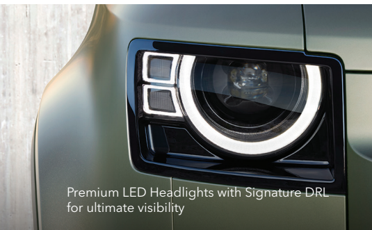
Premium LED Headlights with Signature DRL for ultimate visibility