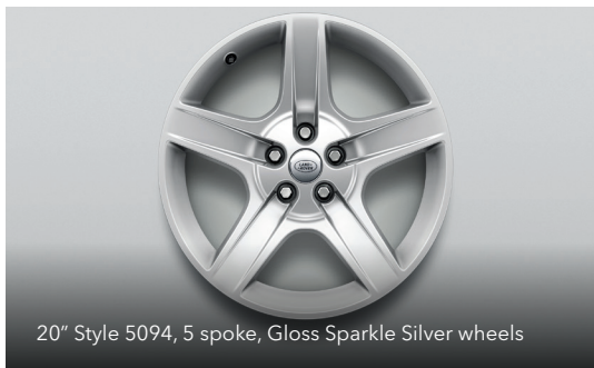
20" Style 5094, 5 spoke, Gloss Sparkle Silver wheels